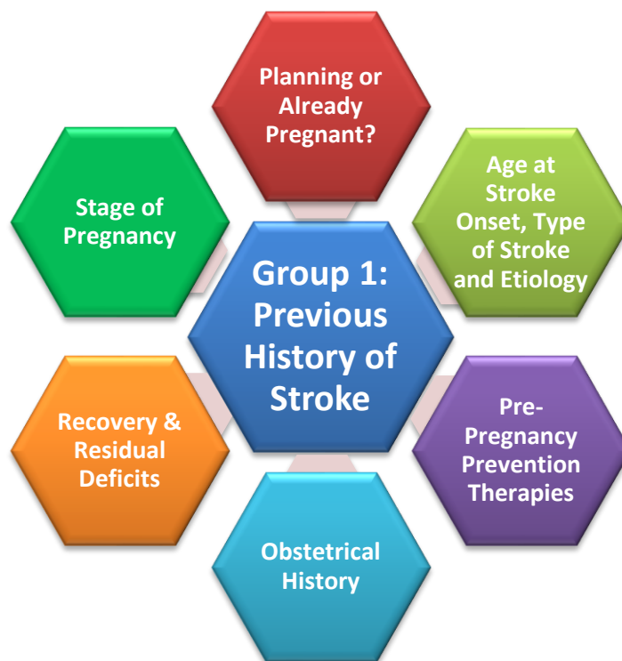
FIGURE 1: WOMEN WITH A HISTORY OF STROKE/TIA WHO ARE PLANNING TO OR ARE ALREADY PREGNANT

The complexities and interdependencies that may arise in these patients require an individualized approach based on the timing of stroke during pregnancy. Several of the common and clinically important issues to consider are illustrated in Figures 1 and 2 below.